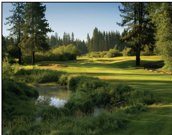
The Middle Fork of the Feather River at Plumas Pines.